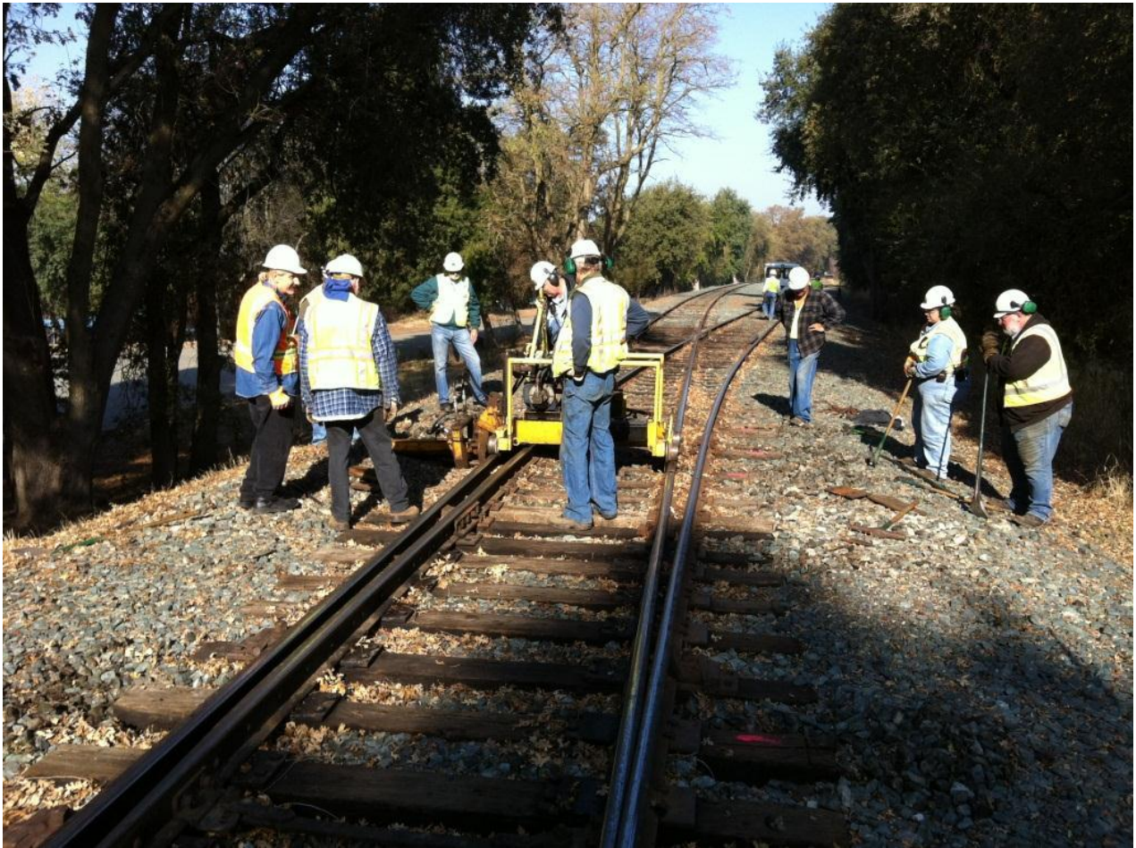
Slowly but surely, the old tie emerges