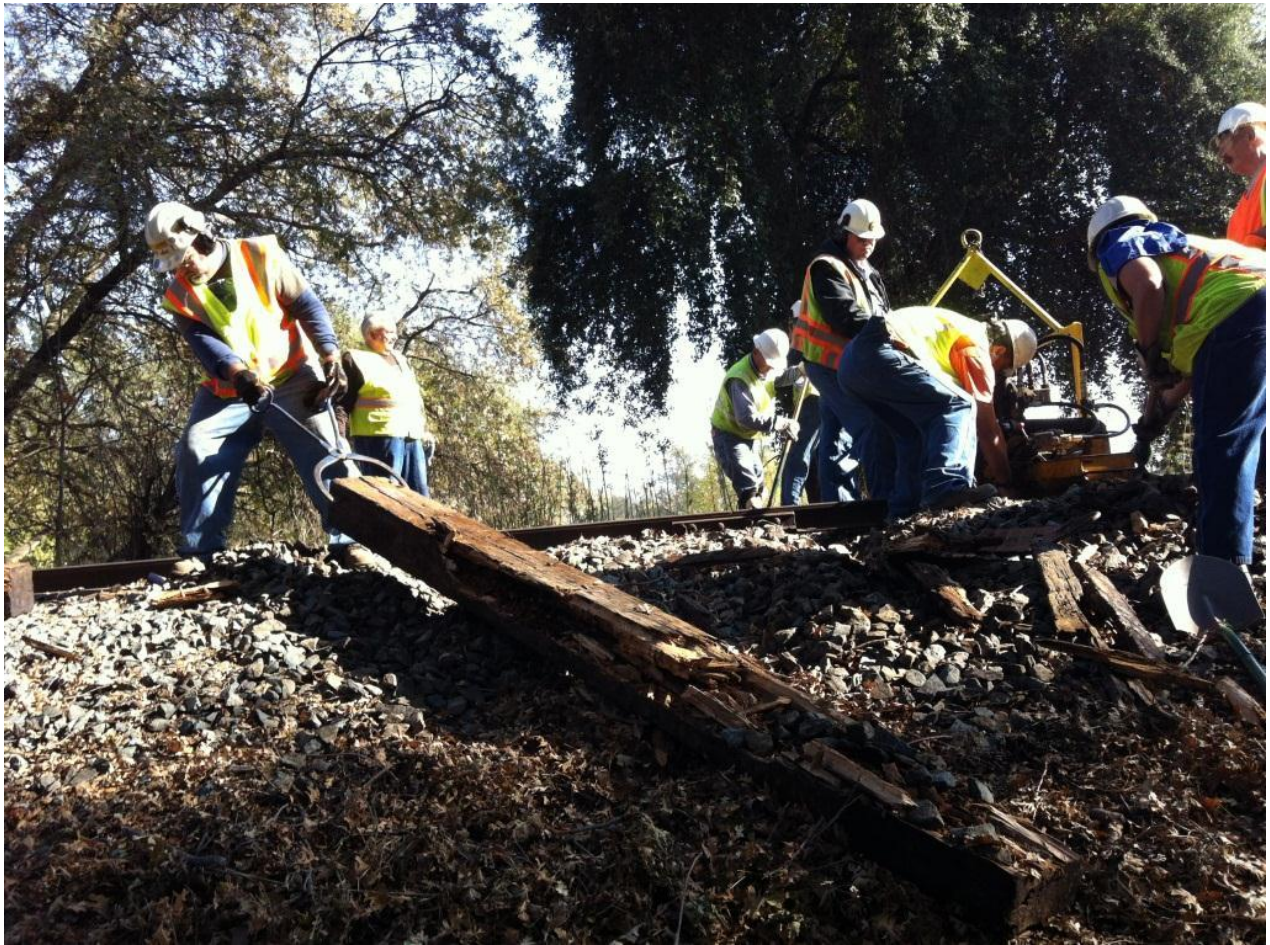
Mike F. drags the remains of one rotten old switch tie away