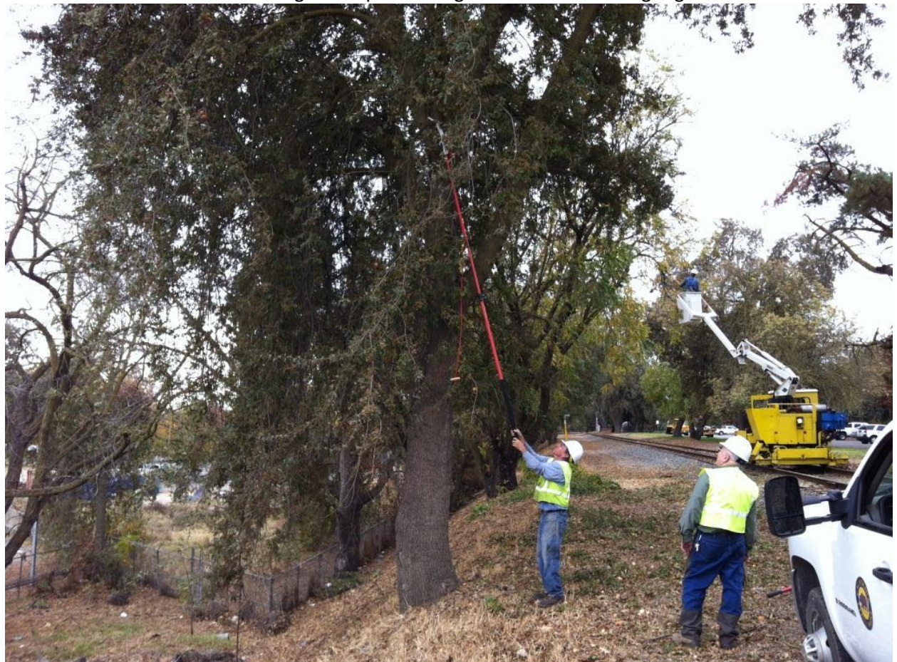
Your mighty Weed Team in action