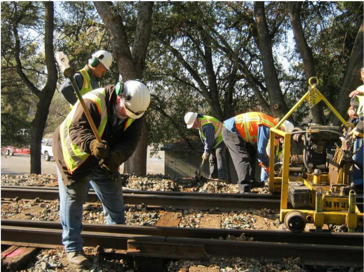
Frank attempts to pound the tie out after the section-gang machine crushed the other end